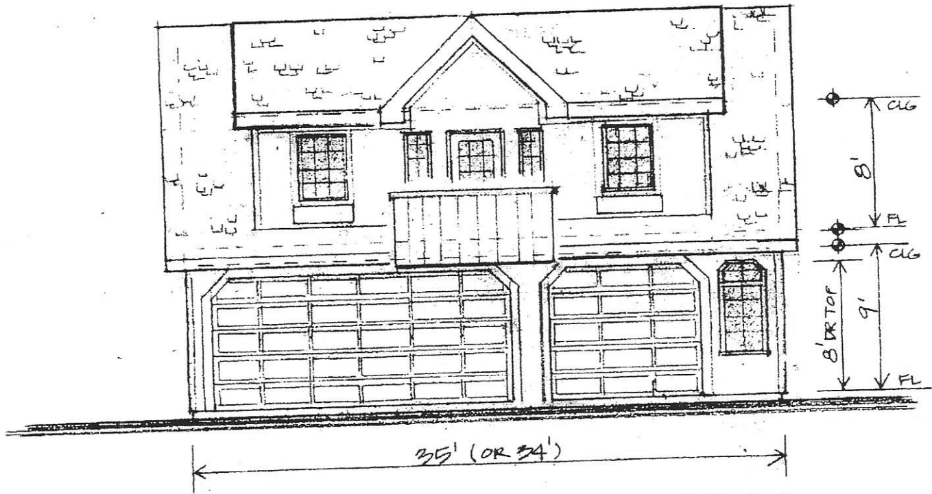
NORTH-FRONT ELEVATION \frac{1}{8}'' = 1'-0''